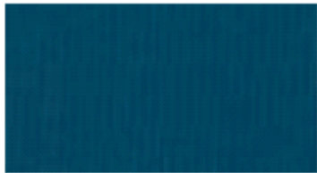
Cotone blu/ Blue cotton