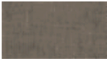
Lino talpa/ Mole linen