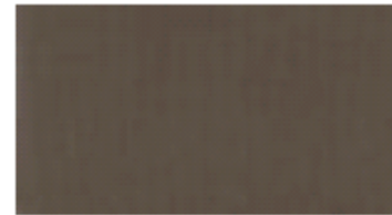
Cotone castoro/ Beaver cotton