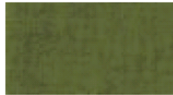
Lino lime/ Lime linen