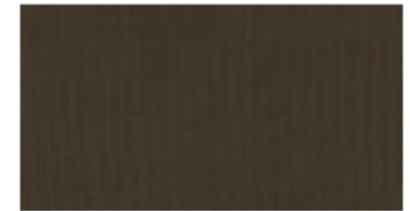
Cotone cioccolato/ Chocolate cotton