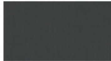
Cotone piombo/ Lead cotton