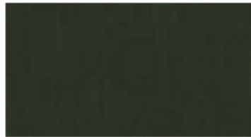
Cotone militare/ Military cotton